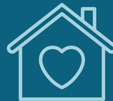
Transitional and Supportive Housing Programs