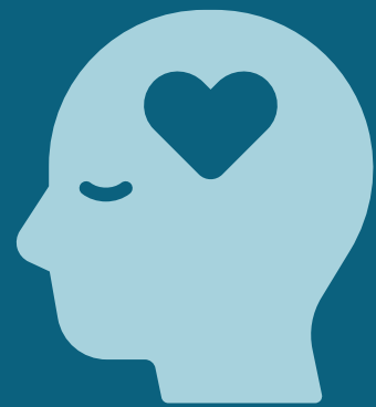
Community Mental Health Programs