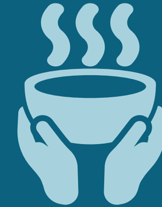
Daily Hot Meals