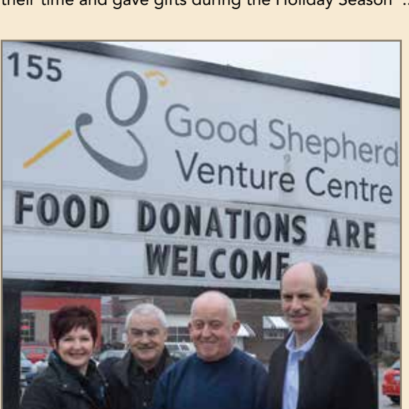
ARCELORMITTAL DOFASCO CORPORATE & COMMUNITY INVESTMENT