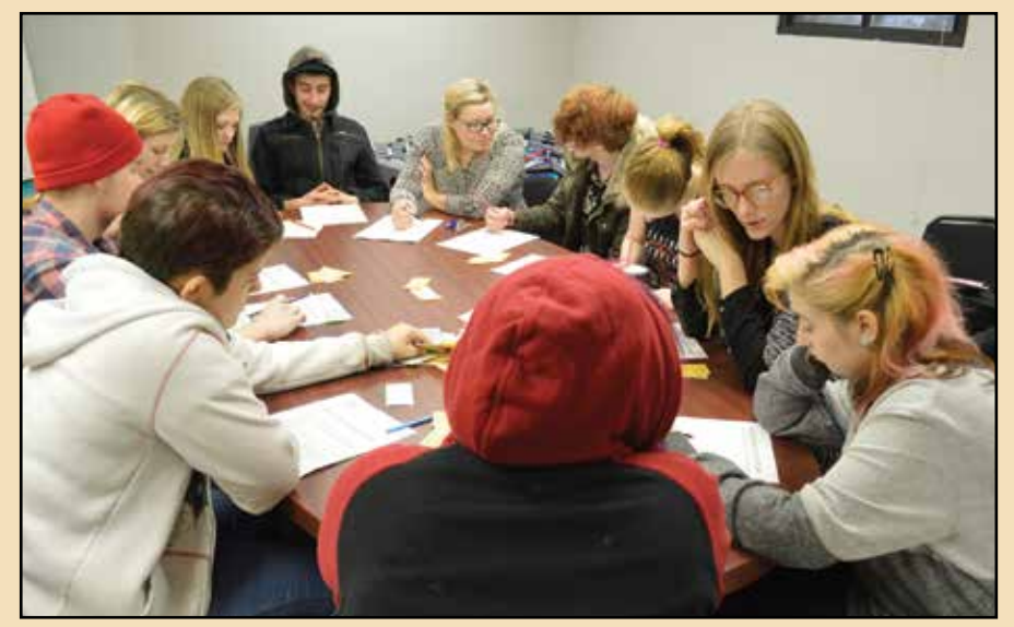
Youth learning budgeting skills at the Notre Dame Community Resource Centre.

For years, Good Shepherd has relied on donations and successful appeals to the City of Hamilton for the funds necessary to ensure that the CRC remains open. Today we are confronted with the reality that there are not enough financial resources to continue our investment in youth. We are faced with the grim