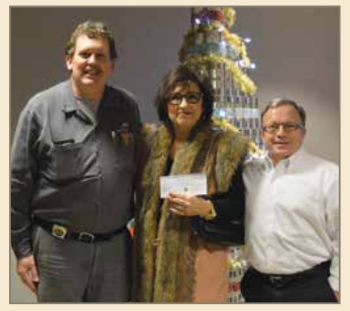
ARCELOR MITTAL DOFASCO EMPLOYEE DONATIONS COMMITTEE